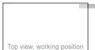
Top view, working position